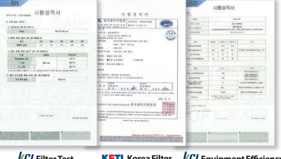
Korea Energy Agency Efficiency No. (EC22-00986K)