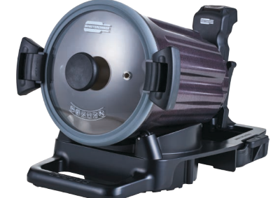
MO-2000 Sapphire Blue